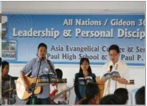
Annual Christmas Caroling Evangelism Fasting Prayer Personal Discipleship Training Seminar