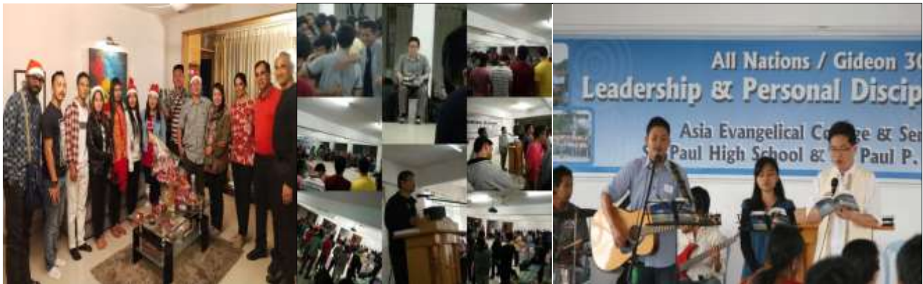
Annual Christmas Caroling Evangelism Fasting Prayer

The spiritual life of the students is nurtured by prayer, Bible reading, meditation and Sunday worship services. Life for the students begins in the early dawn of the day, with early morning watch at 5:30 AM. Spiritual life is strengthened by more informal gatherings for prayer and praise at various hours of the day. Speakers at the devotional services include the President and Faculty, Students, Pastors, and Missionaries from abroad.