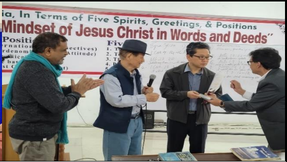
Teaching and administrative faculty members are well respected and appreciated at AECS