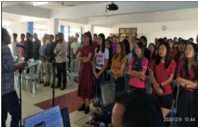
Morning Devotions & Worship Services are daily offered-up

year 1989, they had also established the IEBC College. Before this, they started MTC in Bombay in 1984, and a Christian School in Salem in 1983. Later on convinced that they were called not only to minister to the people of India, though that was primary and in particular, they realized that the College should be a living instrument for preparing committed and dedicated young men and women from neighboring countries also, to be pastors, evangelists and church planters, and leaders in Christian institutions for the task of evangelization of the whole of Asia. As such, the IEBC College was renamed ASIA EVANGELICAL COLLEGE & SEMINARY. The primary aim and goal of establishing the ASIA EVANGELICAL COLLEGE & SEMINARY was and continues to be that along with the pursuit of academic excellence in theological disciplines the equipping and training of the students for the ministry called for spiritual nurture and growth towards Christ likeness.