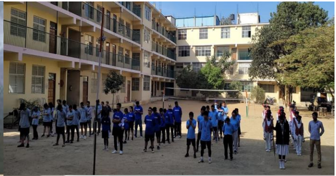
Sports and Christmas Eve