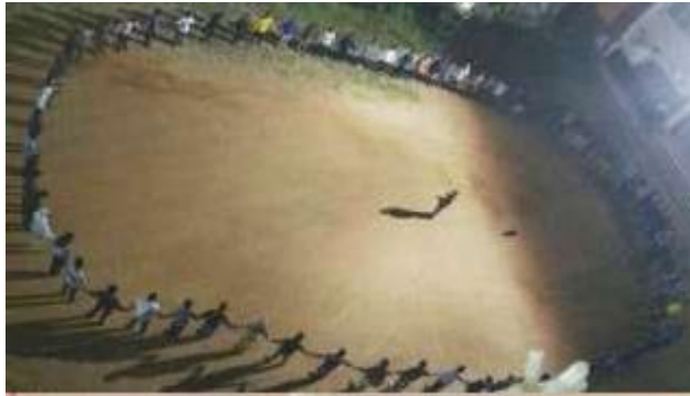
Human Chain Prayer and Sunday School Teachers

times, Sunday worship services, fasting prayers, Sunday School ministries, outreach ministry, Christmas caroling evangelism and other spiritual activities to encourage students to grow spiritually. It also hosts sports events, recreational picnics, and inter-seminary fellowships to foster unity in and around Bangalore City.