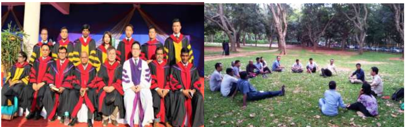
Teaching and administrative faculty members are well respected and appreciated at AECS