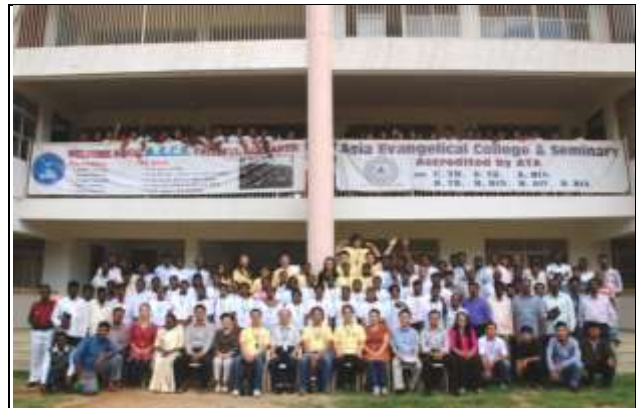
AECS is a wonderful place to build friendship in Christ